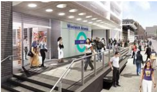
Woolwich Arsenal Station